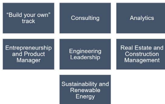
Track areas of specialization for electives

Each student’s program must include at least 9-credits worth of electives selected to provide a track area of specialization. Students can combine two 1.5 or higher credit behavior courses, as long as they meet or exceed 3 credits. We have put together six track areas of specialization below tied to common career paths of Engineering Management degree graduates. Any 5000 or 6000-level College of Engineering non-seminar technical 3 credits or higher course is acceptable. Courses outside of the College of Engineering and not listed below must be approved by the Director of the Engineering Management program via a course petition. The course petition must include a detailed syllabus of the technical content to be covered. Students are also welcome to mix and match courses from different headings or choose courses aligned with their own interests to best serve their professional goals.